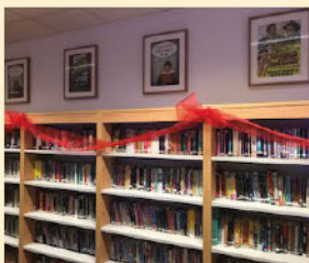
George Mitchell School Library launch