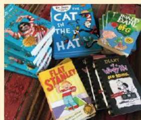
Book gifts ready to send out to Genesis residents