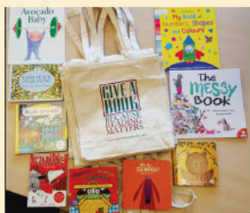
Family Day book bag