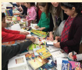
Breakfast Book Club Launch