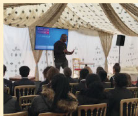
Alex Wheatle at Book Clubs event at Wimbledon BookFest