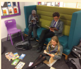
School pupils look through their selection of new books